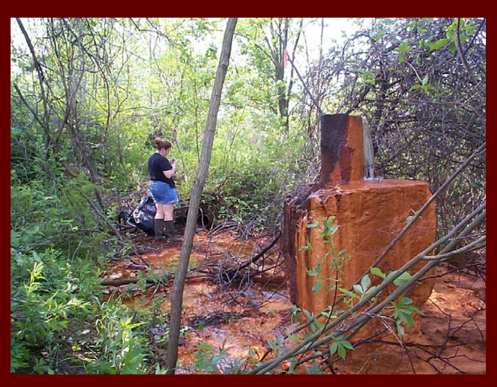
Latrobe Foundation Property Project Final Report Presentation