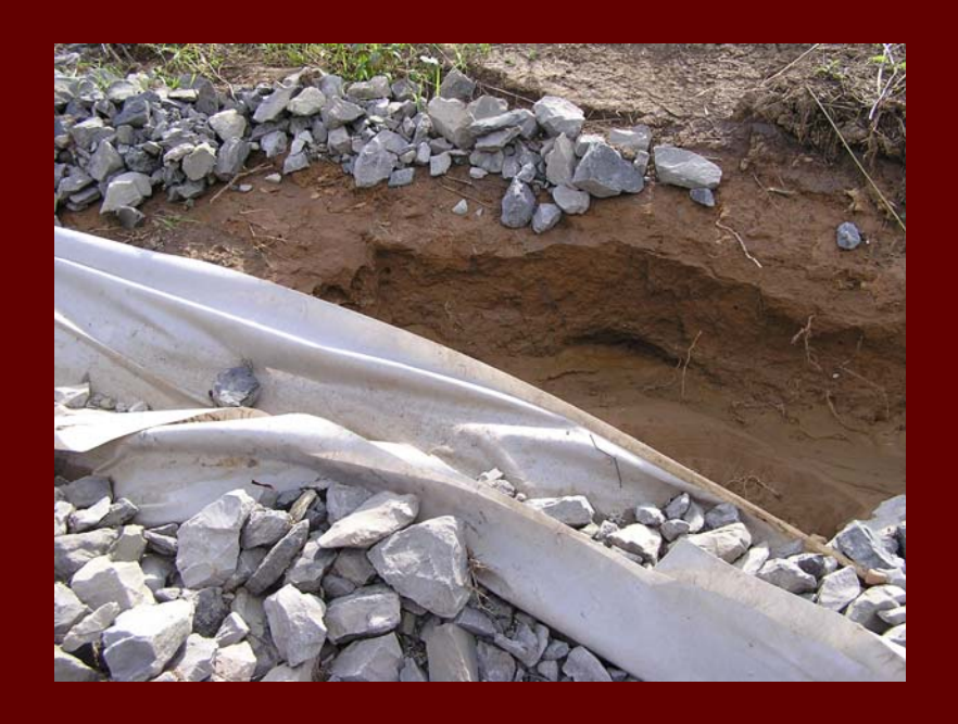
Emergency spillway after flood damage.