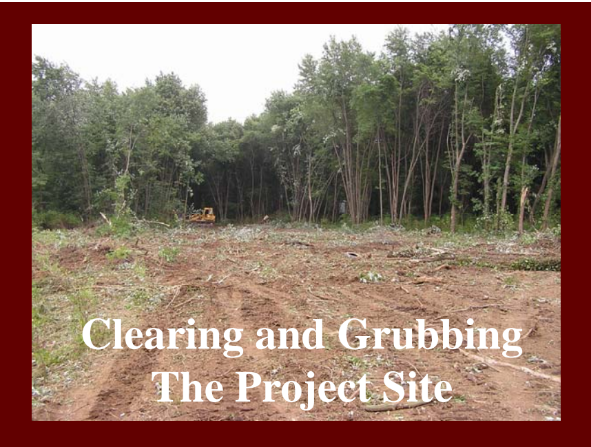
Part I – The construction of the settling pond by R&L Development of New Alexandria