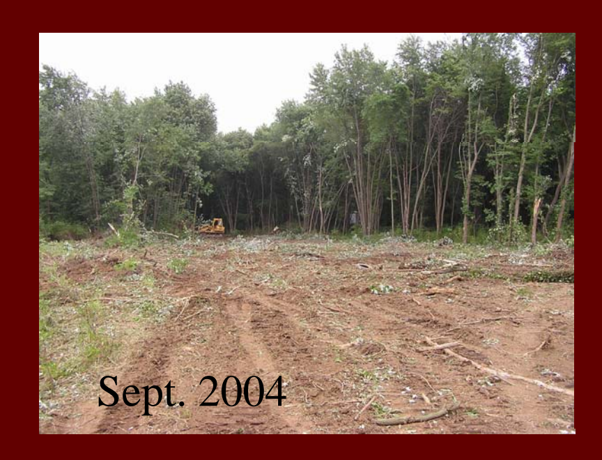
Part I – Before and After