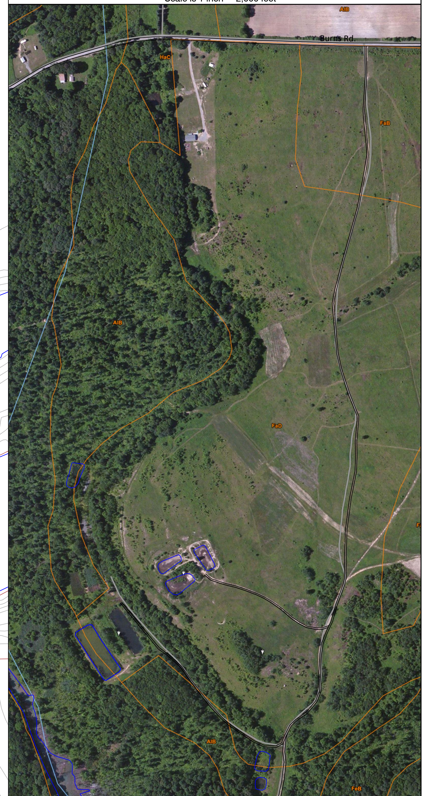
Site Soils and Access Map Scale is 1 inch = 300 feet Note: All soils in project area have been disturbed by mining